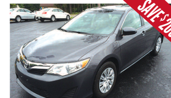
2013 TOYOTA CAMRY America's Most Popular Sedan PAYMENTS AS LOW AS $279/MO*