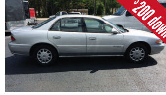
2002 BUICK CENTURY Nice Car, Low Miles

AS LOW AS $200 DOWN... AND DRIVE A NEW CAR HOME TODAY!