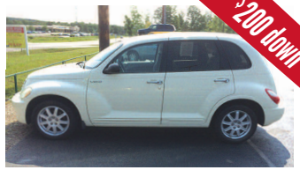
2006 PT CRUISER LIMITED Low miles and Moonroof PAYMENTS AS LOW AS $129/MO*