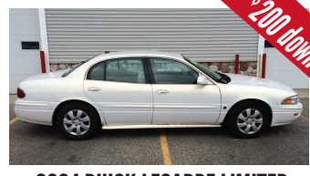
2004 BUICK LESABRE LIMITED Six passenger with great fuel economy PAYMENTS AS LOW AS $100/MO*