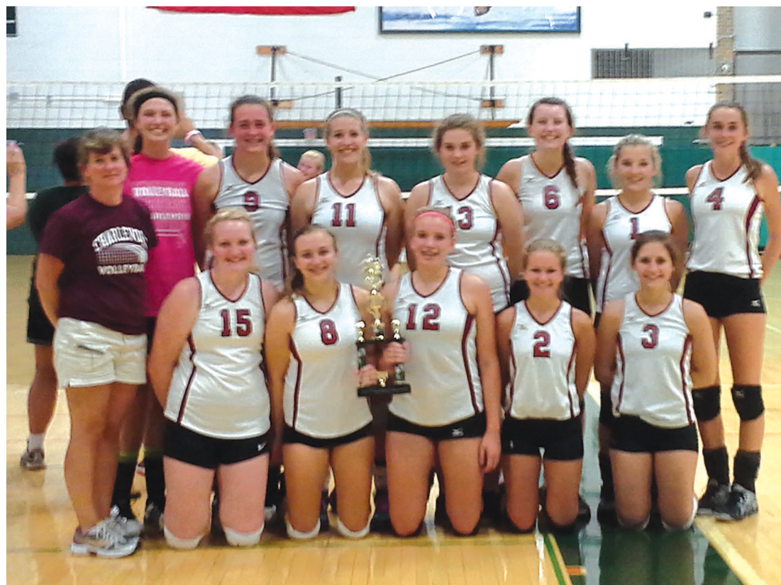
The Charlevoix JV volleyball team recently took 2nd place at the Alpena Invitational.

CHARLEVOIX — The Charlevoix JV volleyball team hosted a Lake Michigan Conference quad mee at the Round Lake High School gym with Grayling, Harbor Springs, & TCSE. Chx defeated Grayling 26-16, 25-13 and Harbor Springs 25-19, 26-24, then lost to TCSE 29-27, 20-25, 6-15.