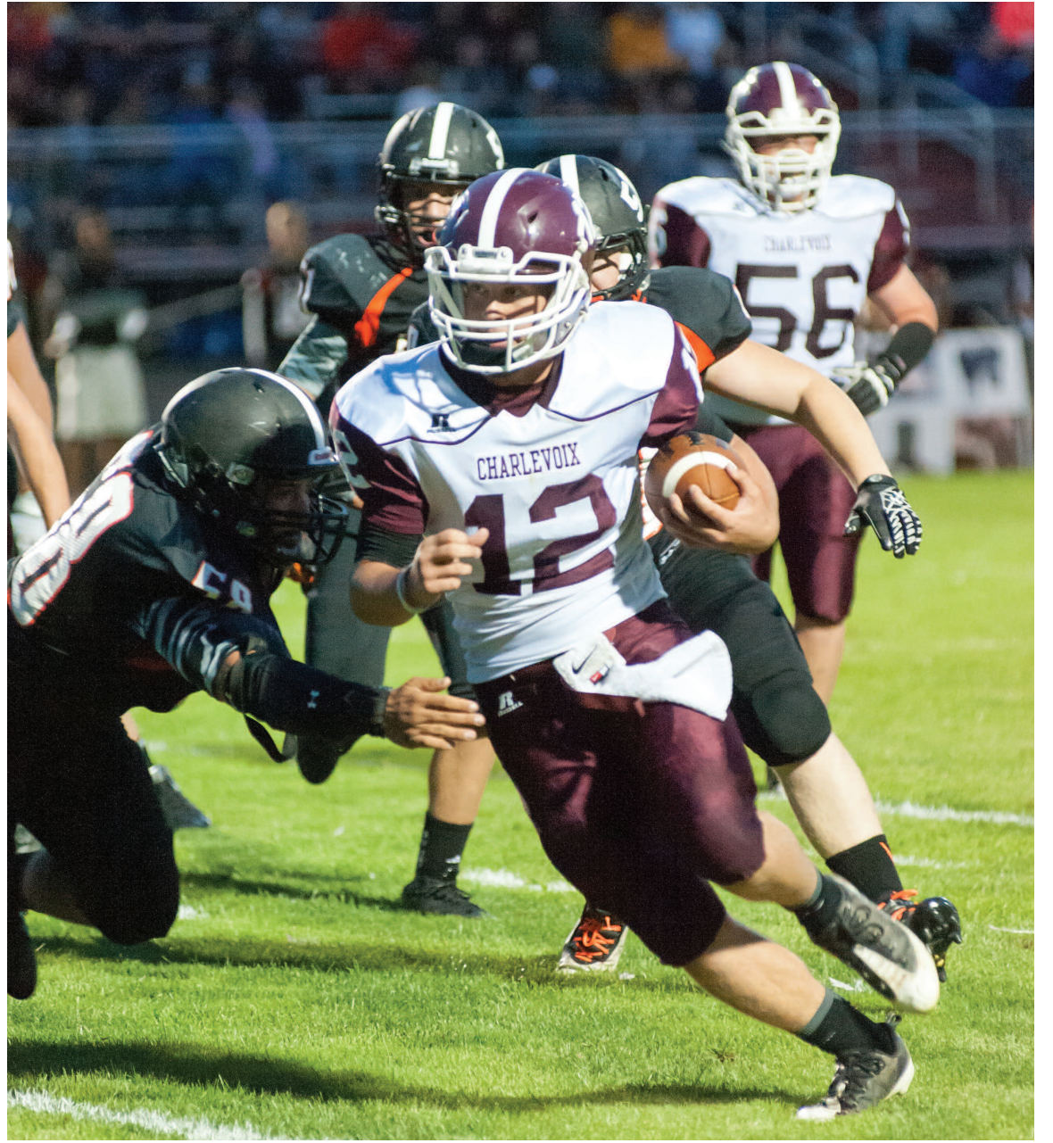
Charlevoix's (12) turns the left corner and makes his way upfield against the Elk's defense.