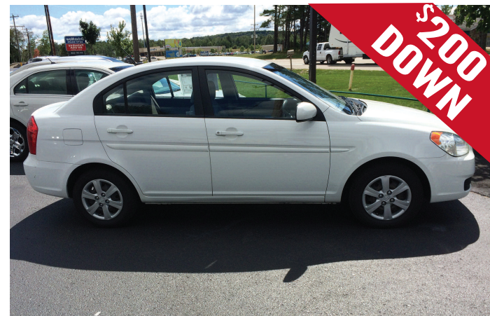
2010 HYUNDAI ACCENT ROOM FOR 5 WITH GREAT GAS MILEAGE