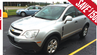
2013 CHEVY CAPTIVA SPORT Great Economical SUV PAYMENTS AS LOW AS $249/MO*