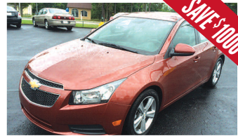
2013 CHEVY CRUZE 2LT Loaded with Leather Trim PAYMENTS AS LOW AS $249/MO*

Ask about our Guaranteed Credit Approval