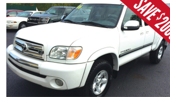
2006 TOYOTA TUNDRA EXTRA CAB 4X4 Fully Reconditioned, Great 4X4! SALE PRICE $14,995.00*